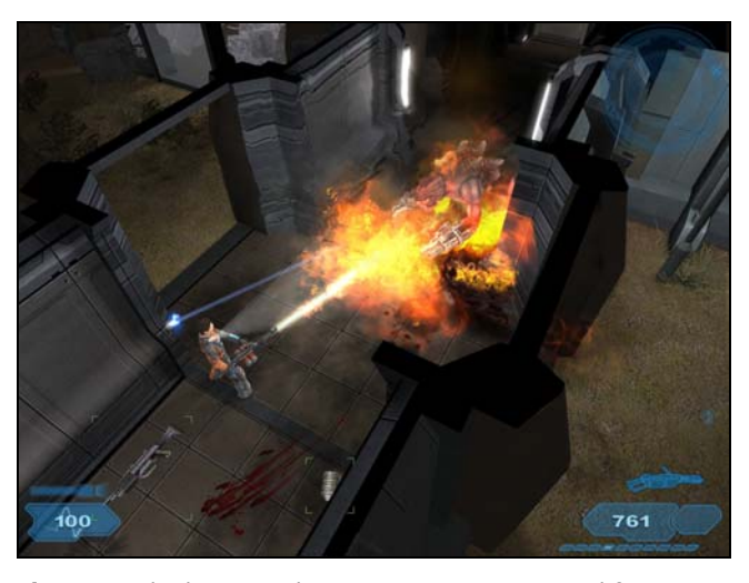
Figure 1. Shadowgrounds is an action game viewed from a top-down perspective.

The game evaluated and tested was Frozenbyte's computer game called Shadowgrounds. Shadowgrounds is an action game viewed from the top-down perspective. See Figure 1 for an illustration.