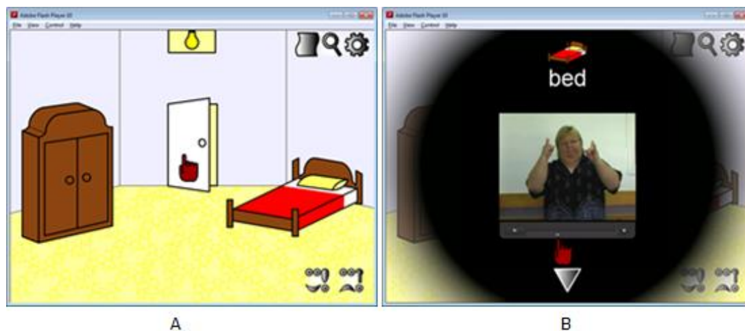
Figure 1. The initial screens of the Sign My World prototype, showing a virtual room (A) and a video flash card (B).

The program prototyped in this research was called Sign My World. It provided rooms of a virtual house for users to explore, as shown in Figure 1A. When users clicked on items in the world, a video flash card was displayed, showing an image of the item clicked and the corresponding English word. A video of the corresponding Auslan fingerspelling, sign, and the spoken English word was then displayed. An example is shown in Figure 1B.