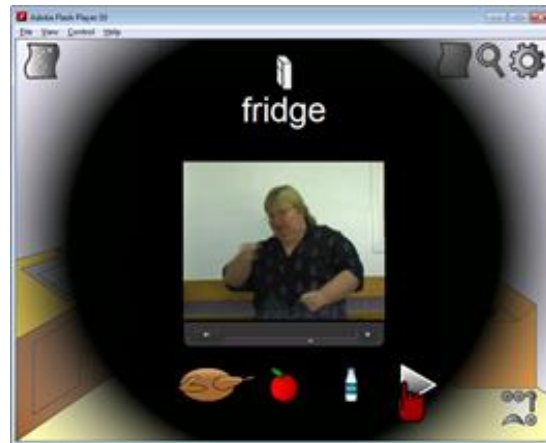
Figure 4. Items “inside” fridge.