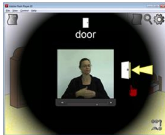
Figure 3. “Door” video flash card with “through the door” button at right.

Richard was the first to understand the “through the door” buttons added to the prototype, visible in Figure 3, and he showed Roger how to use them to move between rooms.