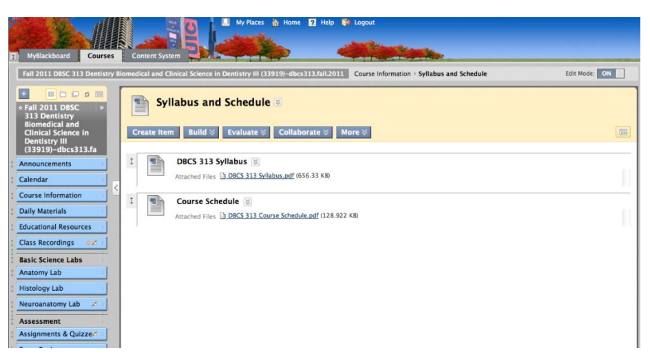
Figure 5. The initial integrated course site developed using results of the Cohort A (traditional curriculum) card sort

Using the categories and information architecture gleaned from Cohort A's open card sort, the author, with assistance from the Office of Dental Education at UIC, constructed a template course site in Blackboard (Figure 5).